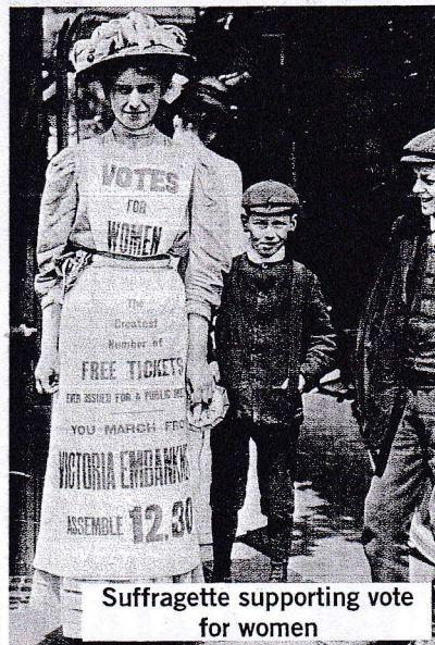
Suffragette supporting vote for women